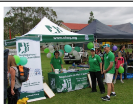
The Grove-Christmas Party Event