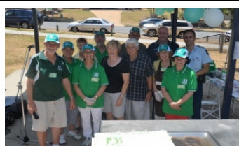
Ferny Grove 20 th Anniversary day at the Upper Kedron