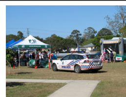
Fenwick Park - Mitchelton - Neighbour Day

IT'S A STRANGE QUIRK OF HUMAN NATURE THAT PEOPLE ARE HAPPIER TO START SOMETHING THAN TO MAINTAIN IT.